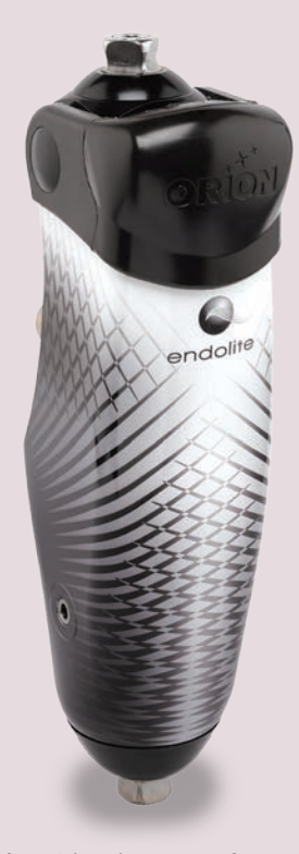
Photo: Orion microprocessor knee

"Our wish is that certain events in the Paralympics won't exist in 15 to 20 years' time" – and that's because there will be no difference in capability between athletes with and without prostheses