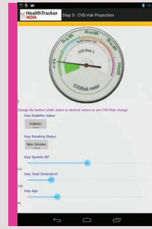
Image: Remote electronic sensors for mobile phones

That is frugal innovation in terms of systems, but there is scope too for low-cost innovation in technology. For example, the universal mobile phone is reinvented in another Indian project as a sensor for diagnostics, linking through existing networks into an infrastructure that connects individuals to a clinical decision system. Further innovation is needed for the diagnosis of different diseases and also for the delivery of treatment. "The challenge for technology is not just at the high end, but also in terms of encouraging engineers to work on mechanisms to deliver frugal healthcare." Professor Norton said.