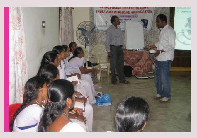
Photo: A village-based healthcare 'ecosystem' utilising digital health technologies

The next generation, he says, will see blood pressure sensors as standard on phones and other devices