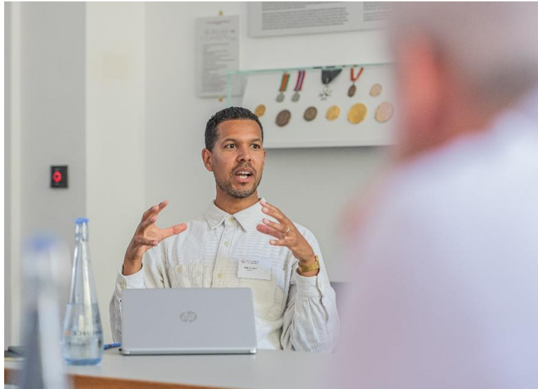
Cohort 1 launch day and inclusive leadership training workshop

We expect this programme to make a significant impact on awardees and their organisation, and it will provide the opportunity for their teams to be the catalyst for systemic change in the wider engineering ecosystem.