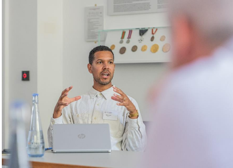
Cohort 1 launch day and inclusive leadership training workshop

We expect this programme to make a significant impact on awardees and their organisation, and it will provide the opportunity for their teams to be the catalyst for systemic change in the wider engineering ecosystem.