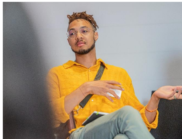
Cohort 1 awardees participating within workshops.

As all team members will need to reflect and write answers to their own questions before coming together to submit one group application, we recommend that you draft your application in a shared document for your group. You and then copy your final submission into the online application form.