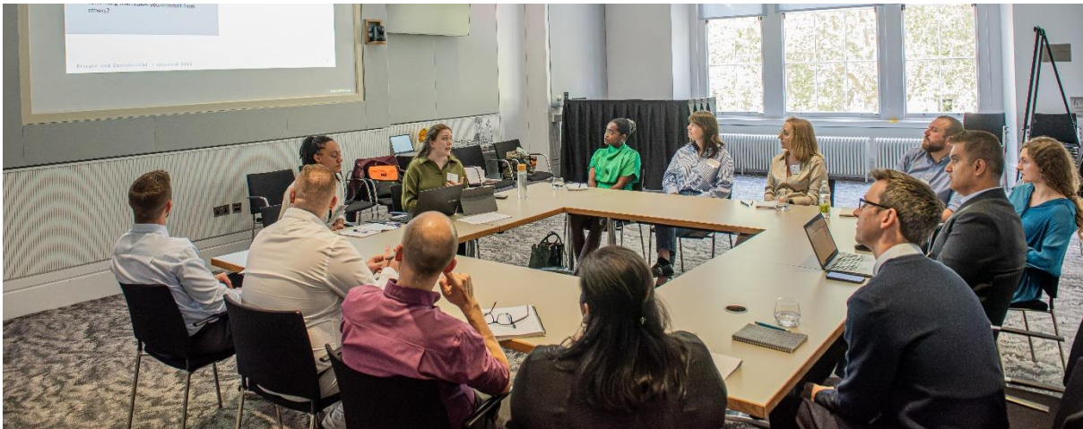
Inclusive leadership training workshop with mid-career leaders

We appreciate that this four-person team requirement may be more difficult for organisations with low employee numbers. We are keen to learn if this model should be adapted to suit micro-organisations and welcome your suggestions on this during the pilot.