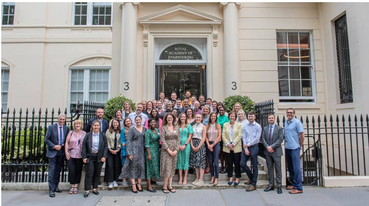
Cohort 1 of the Inclusive Leadership Programme

This awardee guidance document contains the information required for you to apply for this unique opportunity. Cohort 2 of the pilot phase applications will open in November 2023 .