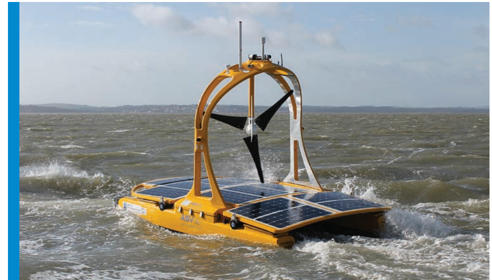
The C-Enduro is one of 50 systems developed by ASV. The autonomous marine vehicle with a self-righting hull can operate for up to three months at a time using a combination of solar, wind and diesel energy. It can be used by oceanographers for a variety of sea-going research missions and for security and defence purposes including chemical detection and anti-submarine warfare

The UK’s position on autonomous vehicles is also an advantage. By not signing the Vienna Convention – which, for most countries, limits the degree to which public roads can be used for trials of new kinds of vehicle and new control systems – the UK is in a good position to host real-world trials of next-generation cars.