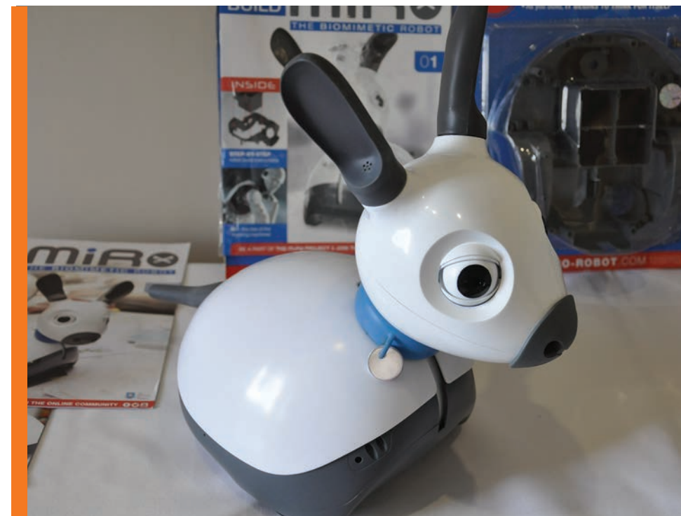
MIRO is a biomimetic robot created by the University of Sheffield that copies the behaviour of animals. It can learn from its interactions and can become loyal to its owner and respond to their voice

Developed countries are experiencing a trend in increasing lifespans and falling birth rates. In the UK, the number of elderly people is rising dramatically at a time when the ability of the state to provide social care is beset by economic difficulties as well as staff shortages. Quality of life for older people is achieved best by enabling them to remain independent in their own homes for as long as possible. Loss of independence is often the result of fairly small-scale changes: psychological factors such as confidence, a marginal reduction in mobility, or forgetfulness.