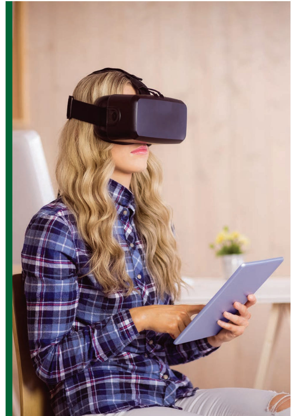
Photo: Woman using virtual reality headset

The implication is that there could soon be different ways to use computers other than through keyboard and mouse or touchscreen interfaces. The user will interact through a three-dimensional computer-generated environment