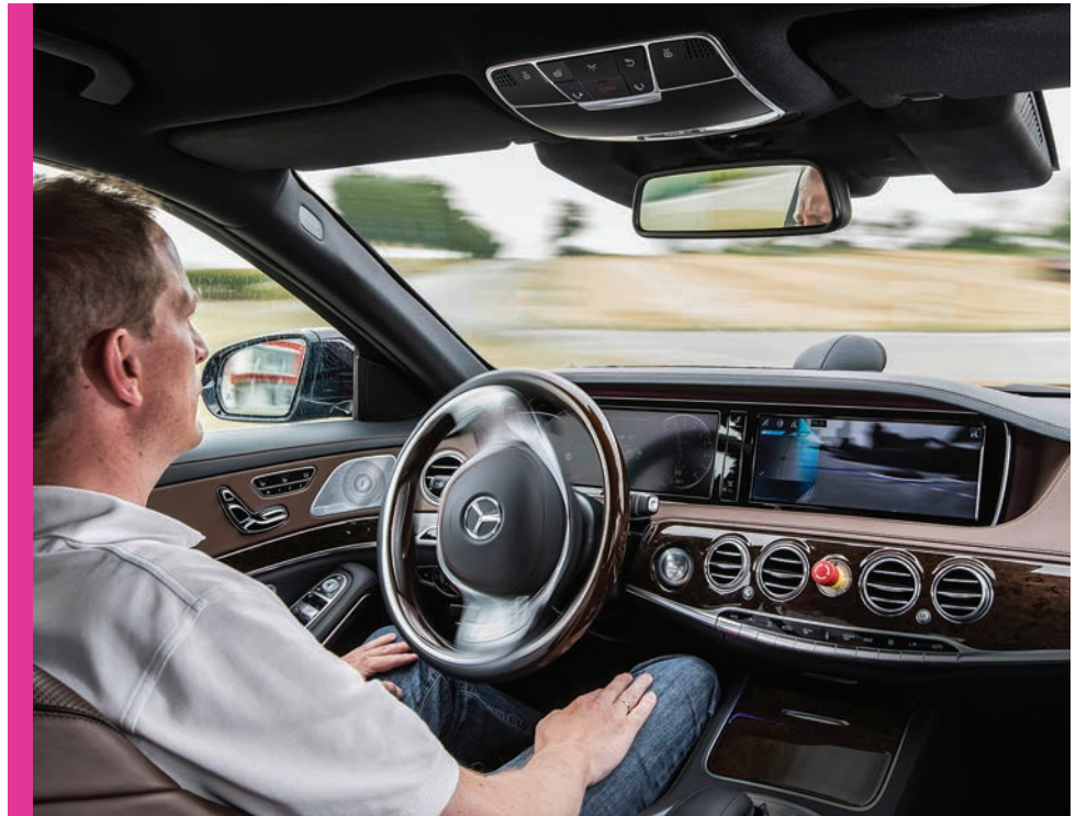
The Mercedes S500 autonomous car uses sensors already fitted on the production S-Class to 'see' obstacles and interpret roadside information and a sophisticated route pilot to navigate the way. In September 2013 the pilot car took on traffic lights, roundabouts, pedestrians, cyclists and trams, as it navigated its way from Mannheim to Pforzheim, in western Germany

The concept of automating some of the assistive functions that could enable older people to retain their independence for longer is highly attractive