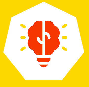
5 innovators enrolled