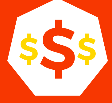
In excess of $192 million raised as further funding by innovators to support their technology