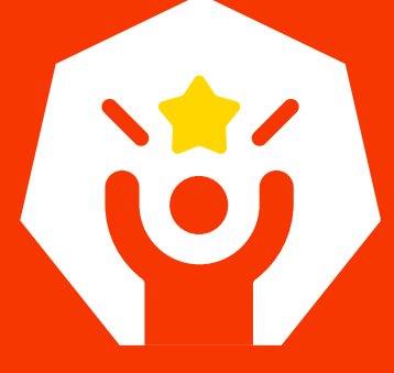
More than 6,800 jobs created through innovators' companies

commercialised their innovation and gathered in an active online community