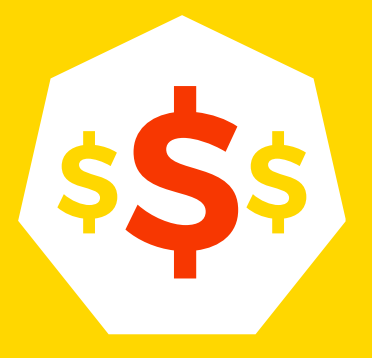
Over $1.2 million of third party follow-on funding raised