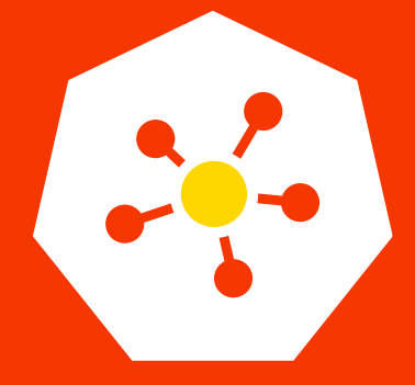
Since 2014 1,450 LIF alumni from 19 countries

commercialised their innovation and gathered in an active online community