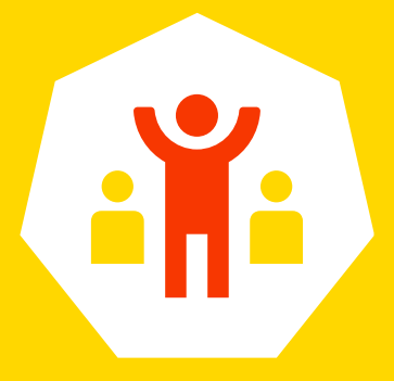
91 alumni members